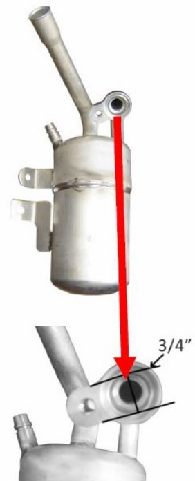
1411867 Second Generation Design

Most 2000–2007 Ford Focus systems on the road today will feature the second-generation design (1411867). gpd recommends updating systems that feature the first-generation design (1411664) with the second-generation design at time of service along with the suction hose.