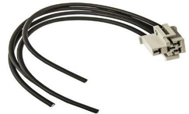
1712270 Blower Motor Resistor Pigtail

For proper installation, reference the guidelines below.