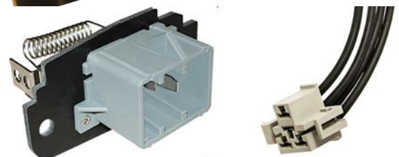
1711725 Blower Motor Resistor

gpd blower motor resistor 1711725 is a direct fit replacement for the front blower motor resistor in both manual and automatic A/C systems. It has a two-hole mount.