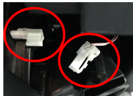
2. With the ignition off, unplug thermistor