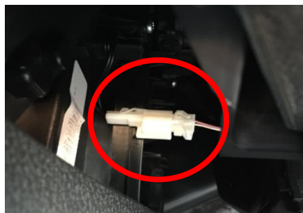
1. Locate thermistor connector which is usually located near the bottom of the glove box area.