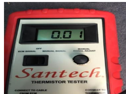
4. Power vehicle on and using the instructions provided, you can measure the resistance coming in from the AC control module or manually control the signal.