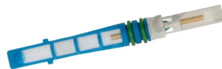
Figure 1.5 Orifice Tube (3411241)