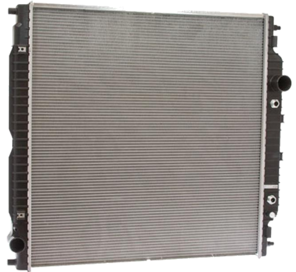
2887C • Radiator Quick Connect Transmission Oil Cooler Fitting Style

gpd recommends the use of a transmission line quick disconnect tool when disconnecting the transmission lines on a radiator with quick connect style fittings.