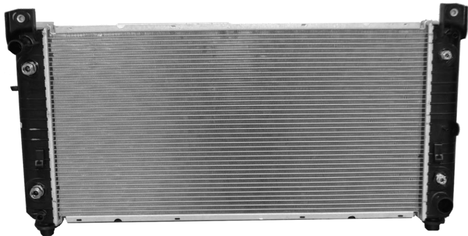
2370C • Radiator w/TOC; w/ EOC 34" x 17 ½ x 1 Core