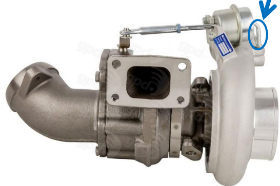
2511267 • New Turbocharger Automatic Transmission

* Always change engine oil prior to installing a new turbocharger. *