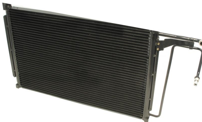
3642C · Parallel Flow Style Replacement Condenser

Due to model updates, the replacement condenser and original condenser design may vary for the applications listed above. The original, 1 st generation design, is a piccolo style condenser. Most replacement options on the market today will feature the 2 nd generation design, a parallel flow style condenser. In addition to style changes, the 2 nd generation design is shorter in length compared to the original serpentine condenser design and may require mounts to be adjusted.