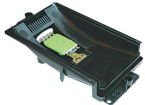
1712036; Automatic A/C; Black Resistor Housing