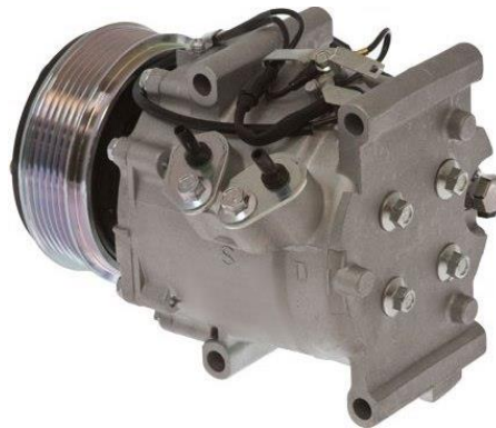
6511562 • Side by Side Hose Connections