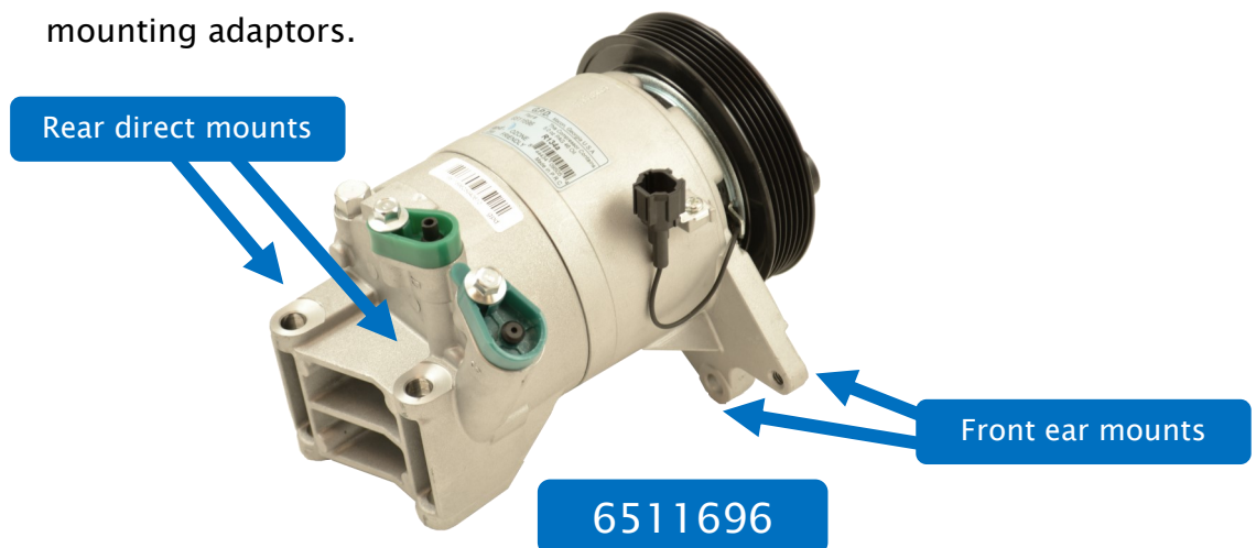
Rear direct mounts