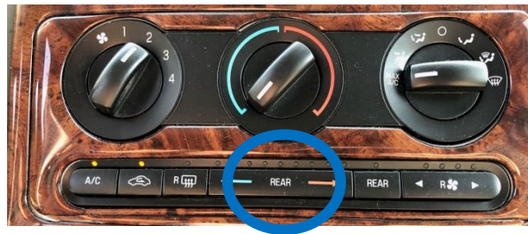
Rear Air Controls

Most SUVs and more and more sedan style vehicles will have two air conditioning systems to accommodate “rear air”, a rear air conditioning system. The rear air system may be located through the roof of the vehicle or behind the center console. This second rear air system will be held in an HVAC unit and include an evaporator, blower motor, heater core, actuators, and rear expansion valve. This is typically located in the trunk area. The main A/C unit under the hood will be connected to the rear air unit by a series of lines. The compressor found in the main A/C unit will pump refrigerant to the rear evaporator, where the blower motor will blow cool air through the rear vents as assigned by the controls. Refrigerant will then continue to circulate through both A/C systems. Failures in either system may cause damage to both.