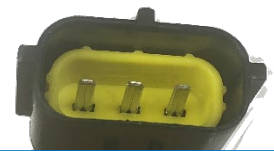
Connector on Older Model