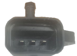
Connector on Newer Model