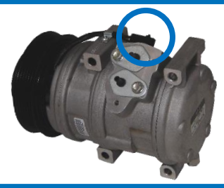
6512103 Late model design with wire harness

6512102 Late model design with wire harness