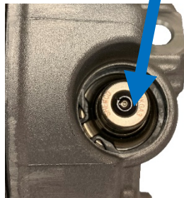
Internally Controlled Compressor