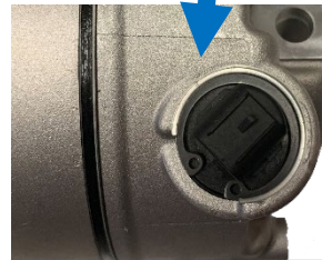
Externally Controlled Compressor