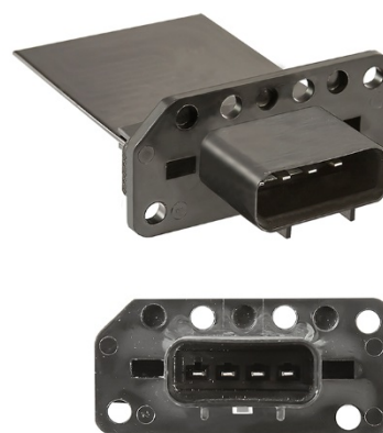
1712209 2008–2012 Ford Escape Blower Motor Resistor; Manual A/C