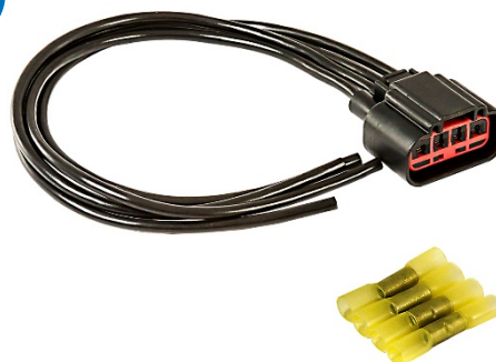
1712341 2008–2012 Ford Escape; 2008–2011 Mercury Mariner Blower Motor Resistor Pigtail; Electrical Connector w/ Waterproof Butt Connectors