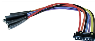
1711755 Blower Motor Resistor Pigtail

The 1711755 is a replacement blower motor resistor pigtail that comes with the same color coding as the wiring harness and includes heat shrink over the butt connectors. All you need to do is cut the old pigtail connector out, match the wire colors together, then crimp the lines. Finally, using a heat source, heat the heat shrink connectors to waterproof them.