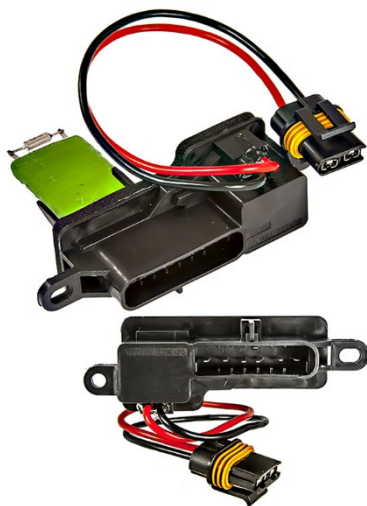
1712229 Blower Motor Resistor

Blower motor resistor 1712229 is a direct fit blower motor resistor replacement with two hole mounts.