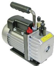
5811368 Vacuum Pump