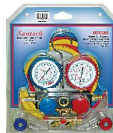
5811258 Gauge Set