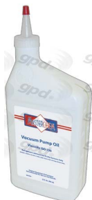
Vacuum Pump Oil gpd #8011277