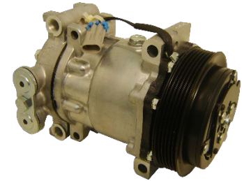
gpd compressor 6511340 is a Sanden style replacement for 6511339