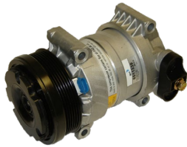
gpd compressor 6511339 is an OE HT6 style replacement (6 groove; 2:00 coil; 4.96in diameter)

gpd offers two Sanden style replacement compressors as well as two OE HT6 style replacement compressors for popular 1996–2002 Chevrolet, GMC, Isuzu, and Oldsmobile trucks and SUVs.