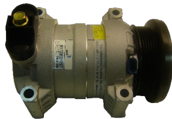
gpd compressor 6511338 is an OE HT6 style replacement (6 groove; 2:00 coil; 4.33in diameter; Hoses built to top)