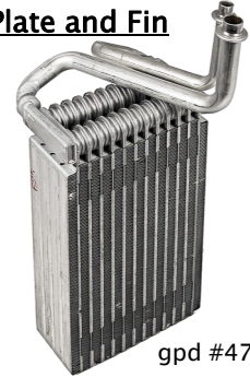
Plate and Fin