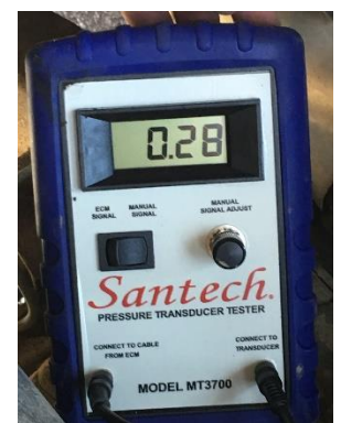
5. In manual signal mode, you can control the voltage going to the transducer to test it is working within the correct parameters.

Manufacturer names, logos and part numbers are for reference only. All prices, taxes and availability are subject to change without notice. This document and any files transmitted with it are confidential and intended solely for the use of the individual or entity to which they are addressed. If you have received this document in error, please delete it immediately. Note that any views or opinions presented in this document are solely those of the author. Any unauthorized review, use, disclosure, or distribution is prohibited. Global Parts Distributors, LLC (gpd) accepts no liability for any damage caused by any virus or other means transmitted by this document. © Global Parts Distributors, LLC (gpd)