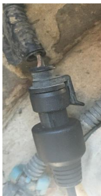
3. Connect the pressure transducer tester between the transducer switch and the electrical connector.