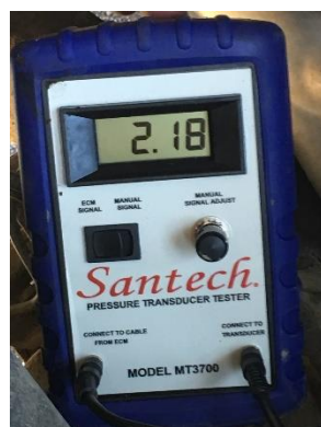
4. As you start the vehicle, the power will engage the tester. This image shows the ECM voltage signal.