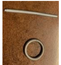
Spring Lock Fitting O-Rings and Spring