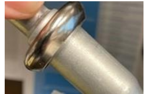
Example of Ford Spring Lock Fitting

*NEVER use PAG oil to lubricate o-ring seals. Because PAG oil is hygroscopic (absorbs moisture), it can lock the fitting in place, making it difficult to disconnect without damage