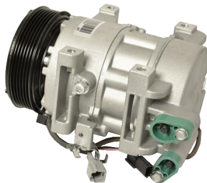
6513059 • Two Electrical Connections

Refer to gpd Tech Tip #112, 'Externally Vs. Internally Controlled Compressors: How to Tell the Difference' for more information.