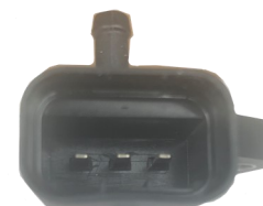
Connector on Newer Model