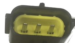
Connector on Older Model