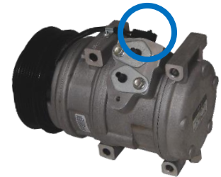
6512103 Late model design with wire harness