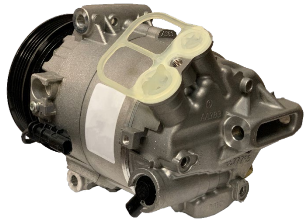
Competitor Design without Mounting Bolt Holes

Manufacturer names, logos and part numbers are for reference only. All prices, taxes and availability are subject to change without notice. This document and any files transmitted with it are confidential and intended solely for the use of the individual or entity to which they are addressed. If you have received this document in error, please delete it immediately. Note that any views or opinions presented in this document are solely those of the author. Any unauthorized review, use, disclosure, or distribution is prohibited. Global Parts Distributors, LLC (gpd) accepts no liability for any damage caused by any virus or other means transmitted by this document. © Global Parts Distributors, LLC (gpd)