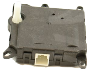
1711895 Rear Blend Door Actuator 2002–2006 Ford Expedition