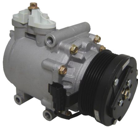
6511483 OE Scroll Style